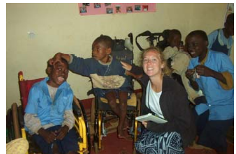
WTM has partnered with the Center for the Empowerment of Females with Disabilities to provide water to 37+ disabled children.

3. Construction of a Resource Center to provide demonstrations of appropriate technologies, educate the community on public health issues, offer up resources for microfinancing opportunities, and create a platform for sharing Gospel materials