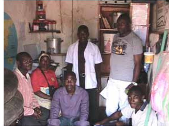
The first class at our Resource Center in town, where students learn about technology and health.

The results of this year's "planting" have been mixed. If projects were our goal, then we would probably consider the work done thus far a success. However, projects are not our goal—transformation is our goal. Projects are simply the vehicle by which lives and hearts are transformed as people encounter the Gospel message in real and practical ways.