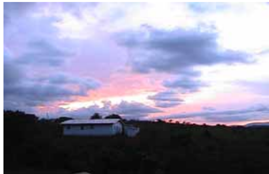
The recently constructed youth hostel took on its first students last month in an effort to provide a home for Fulbe children in the bush that want to attend school but live too far away normally.

This agrarian picture also seems to reflect our sentiments during this particular season of our lives. Many seeds were planted this year in the form of various ministry projects in partnership with our colleagues, including a youth hostel, a resource center to teach technology and health, and various microfinance startups across Cameroon. However, planting is only the beginning of a long season of nurturing and cultivating a good crop. Some things can be managed, like resources. Other factors, though, are more unpredictable, just as the weather is always an unknown when one plants a crop. With this type of crop, though, it's the behavior, attitude and actions of the people involved that become the unknown element.