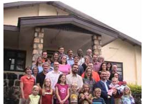
A group shot with our World Team colleagues

A great deal of work is underway by World Team missionaries in Cameroon in the areas of translation and literacy. Please pray for their work on these long-term ministry projects.